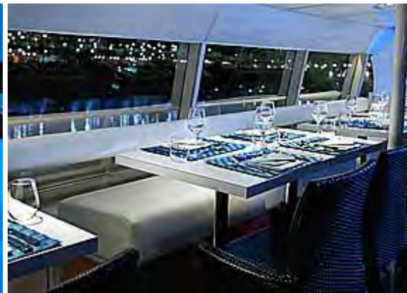
Cruise on the Saint-Lawrence River