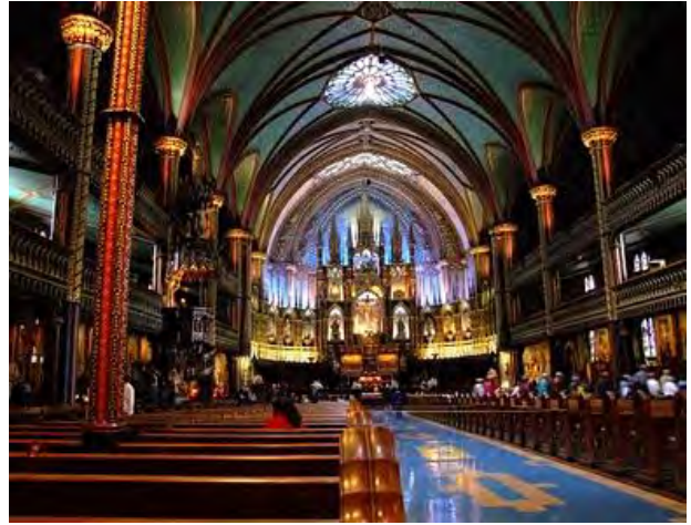
L'Oratoire de Saint Joseph du Mont-Royal St. Joseph's Oratory of Mount Royal