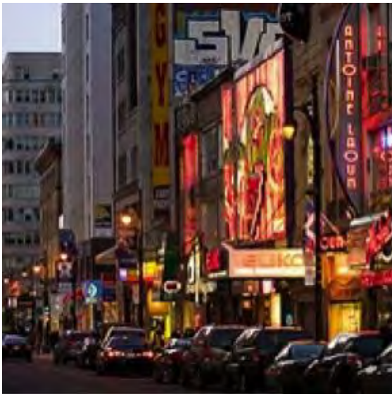
Avenue Ste. Catherine