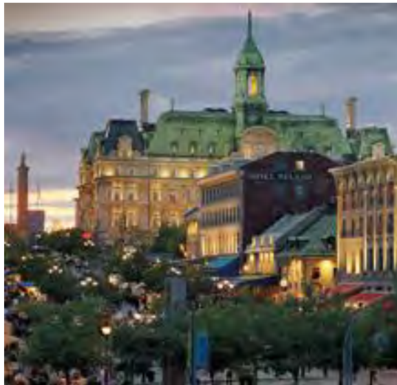
Montréal City Hall