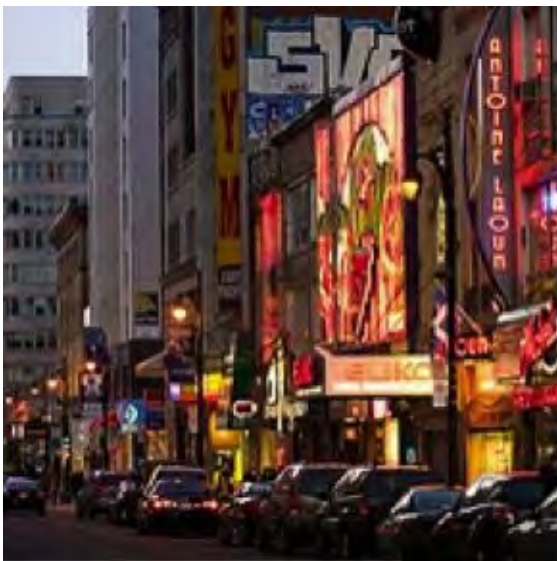
Avenue Ste. Catherine